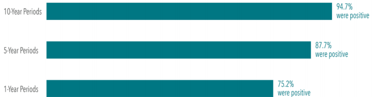
Exhibit 2. Frequency of Positive Returns in the S&P 500 Index Overlapping Periods: 1926–2018

In US dollars. From January 1926–December 2018, there are 997 overlapping 10-year periods, 1,057 overlapping 5-year periods, and 1,105 overlapping 1-year periods. The first period starts in January 1926, the second period starts in February 1926, the third in March 1926, and so on. S&P data © S&P Dow Jones Indices LLC, a division of S&P Global. Indices are not available for direct investment. Index returns are not representative of actual portfolios and do not reflect costs and fees associated with an actual investment. Past performance is no guarantee of future results. Actual returns may be lower.