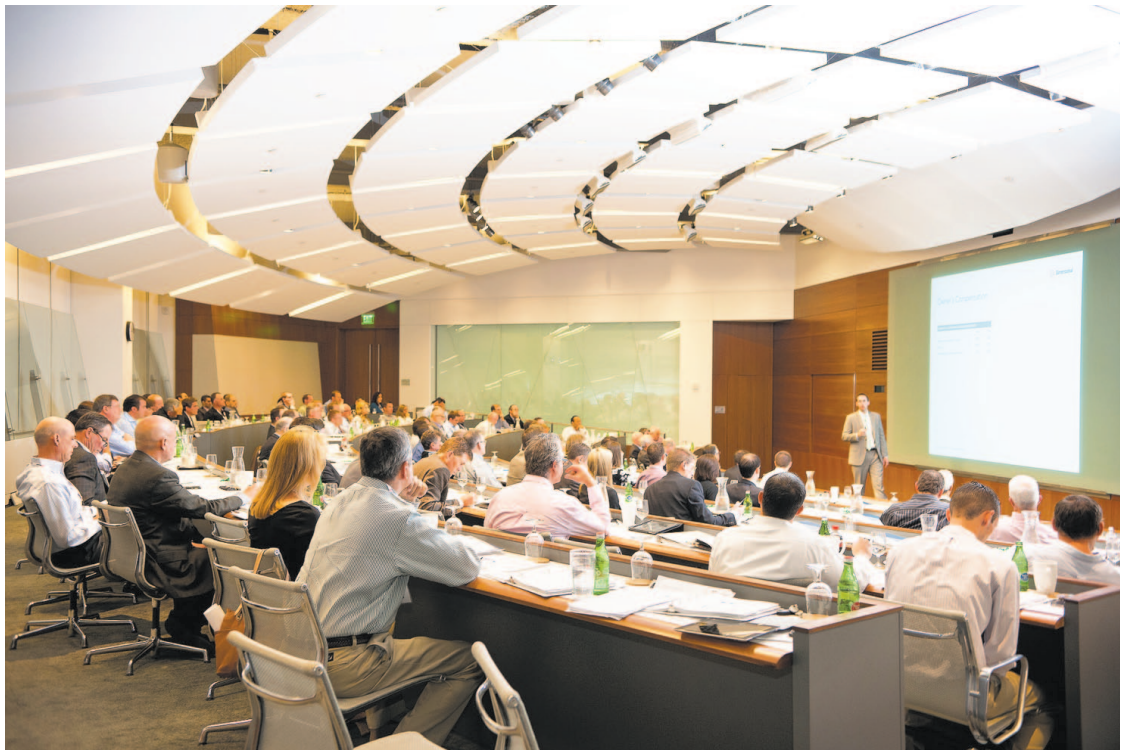
More than 100 advisors came to Dimensional's Austin, Texas, headquarters for two days of seminars.

Advisors selling DFA funds have monthly or quarterly meetings with one another, facilitated by a DFA manager, to discuss portfolio and practice manage-