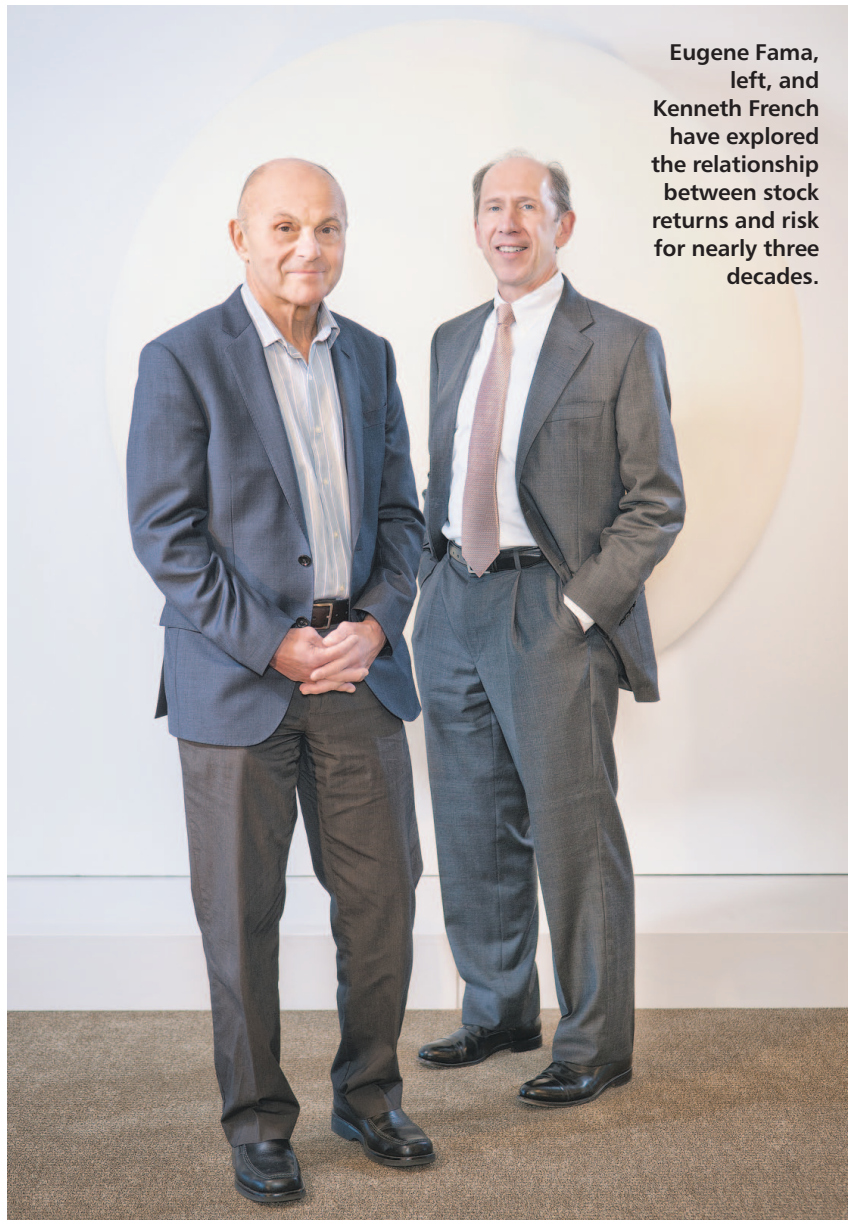
Eugene Fama, left, and Kenneth French have explored the relationship between stock returns and risk for nearly three decades.

The basics of market efficiency are often misunderstood. Some say that if factors such as a stock's value, size, trading momentum, and profitability—all of which are part of your multifactor model—indicate outperformance, then the market isn't really efficient.